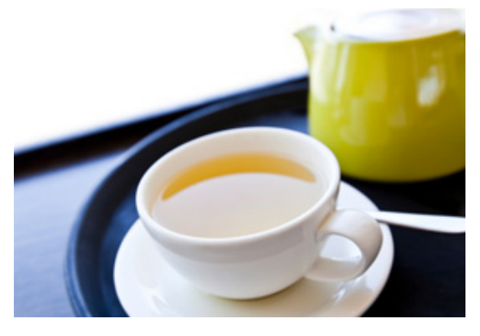
Green tea is part of the traditional Japanese diet

A study that suggested that green tea could reduce the likelihood of developing prostate cancer had a similar weakness. It found that men who drank five cups of green tea a day were about half as likely to develop advanced prostate cancer as those who drank only one cup. This study involved nearly 66,000 men in Japan, who were followed for 14 years. It was a study with a large number of participants and a