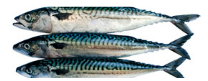
Oily fish is part of the Mediterranean diet

But just because a study is funded by the food industry doesn't necessarily mean it will be of poor quality. However, there may be a vested interest in giving a positive spin to results or getting it into the newspapers for a little publicity.