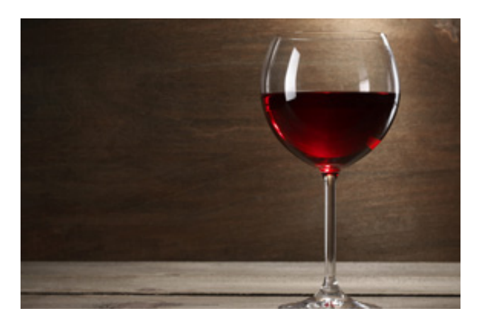
Red wine features regularly in the news

Some of these limitations are discussed below. Knowing about them will help you to sort science fact from news fiction.