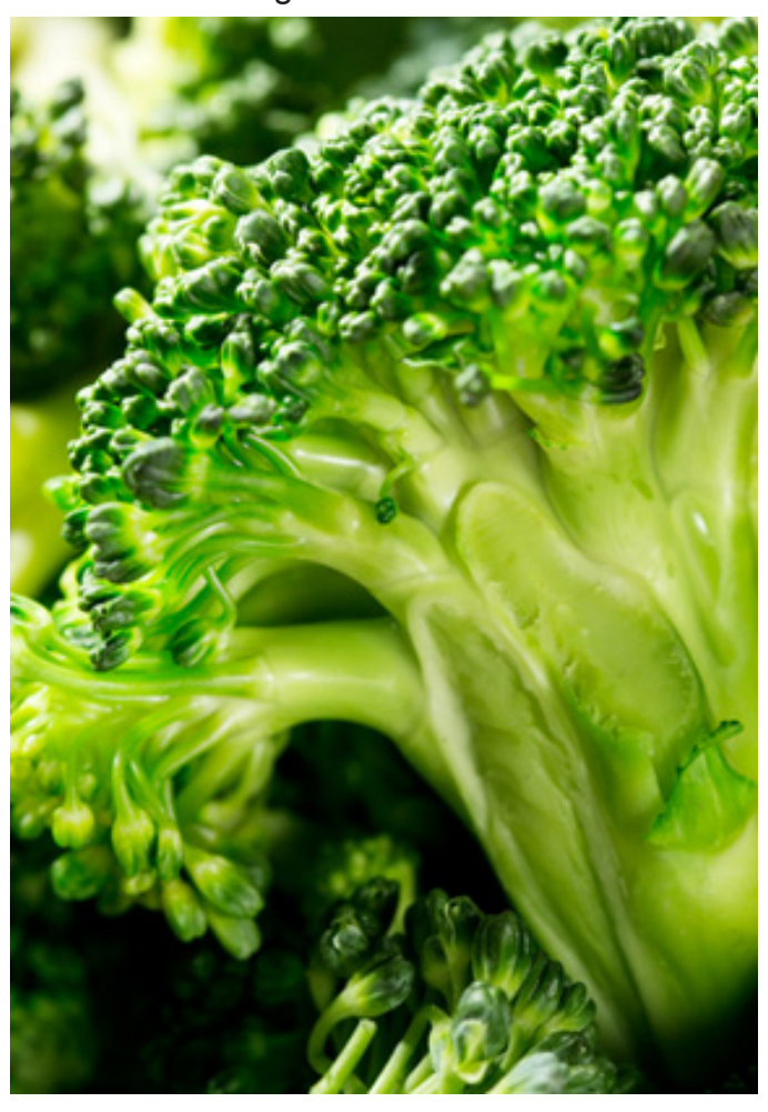
Broccoli is good for you as part of a healthy balanced diet

Eating more non-starchy vegetables, such as broccoli, is associated with a reduced risk of cancer according to the WCRF systematic review on cancer prevention (see above). It is possible that some of the compounds in broccoli may have health benefits, but clinical trials are needed to investigate this.