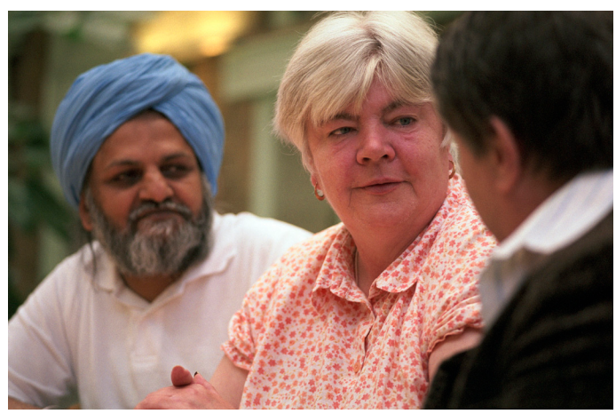
People react differently to different things

long follow-up, both of which are strengths. But it's possible that men who drink lots of green tea are also more likely to adhere to a traditional Japanese diet. This means diet may be a confounding factor. In fact, this is partly what the researchers found – that men who drank more green tea also ate more miso and soy, as well as fruit and vegetables. They also differed in other ways from men who drank less green tea. So it's difficult to say for certain whether the green tea is responsible for the lower risk of cancer or whether other elements in the diet were involved.