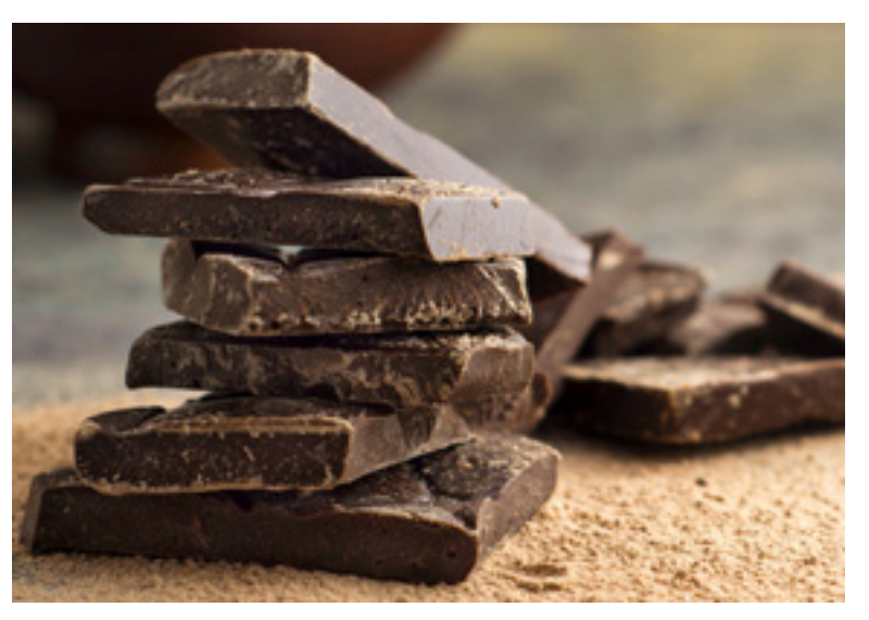
The health benefits of chocolate are debatable

Even our beloved cuppa has been given superfood status. Black tea has been alleged to <u>protect against heart disease</u>. Green tea can supposedly <u>cut the risk of prostate cancer</u>. And it has been claimed that <u>camomile can keep diabetes under control</u>.